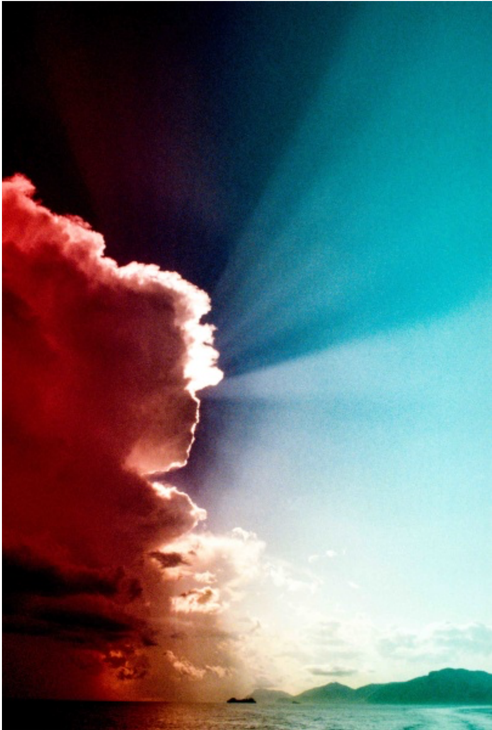
Heaven's Gate, 2019 Amalfi Coast Lightbox 134.62 cm x 88.9 cm 53 x 35 Inches Edition of 3 plus 1 AP £ 8,500.00