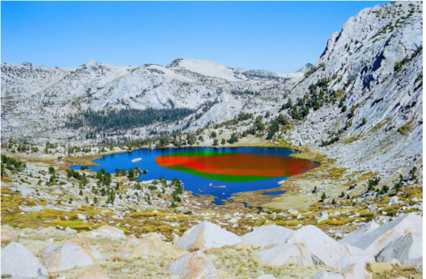
Rainbow Lake, 2022 Double exposure | Yosemite California Giclée Print 53 x 35 Inches 134.6 x 88.9 cm Edition of 3 plus 1 AP £ 2,800.00