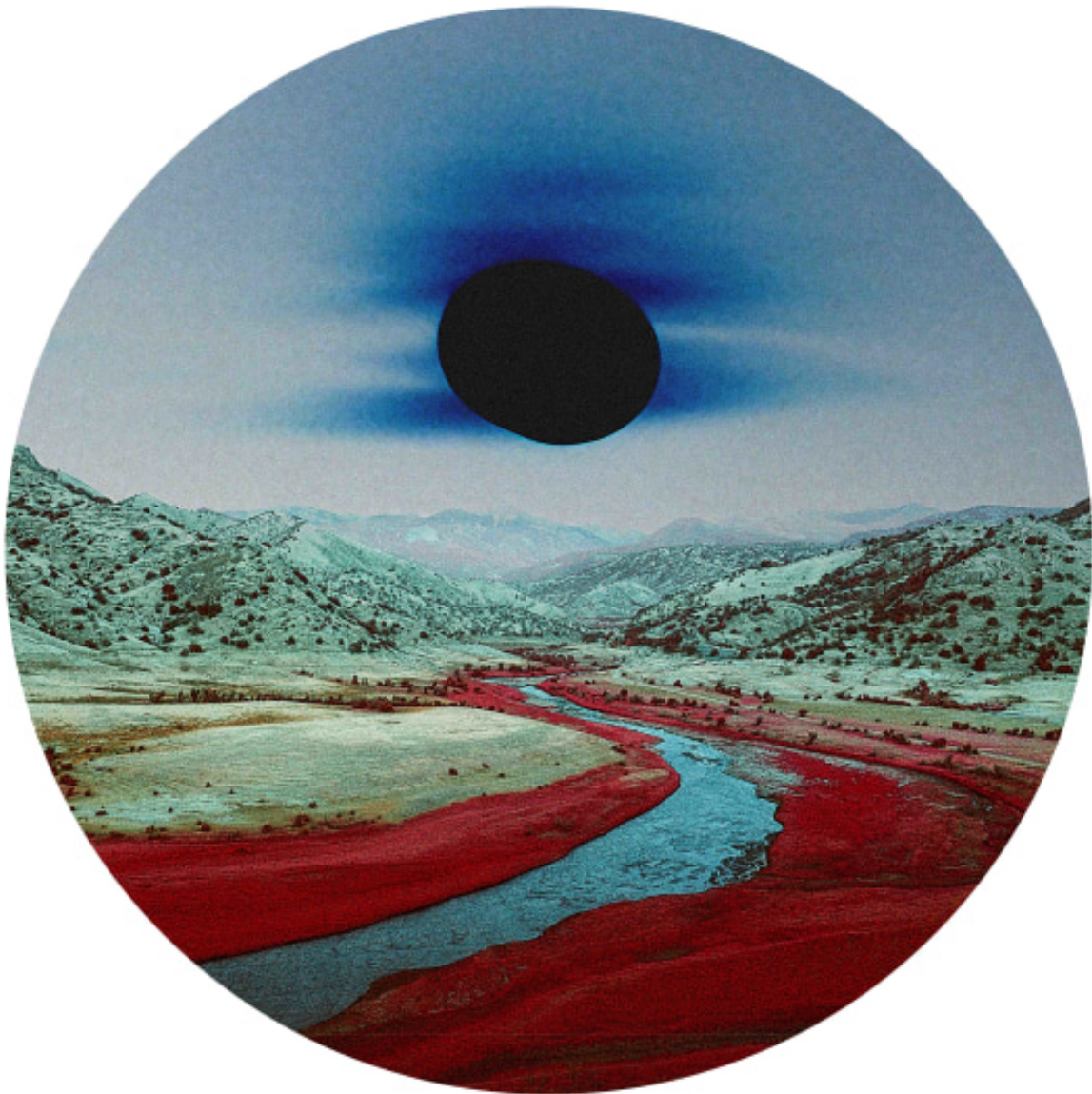
Blue Moon, 2023 Double Exposure | Foothills of Sequoia National Park Lightbox 101.6 x 101.6 cm 35 x 35 Inches Edition of 3 plus 1 AP £ 8,500.00