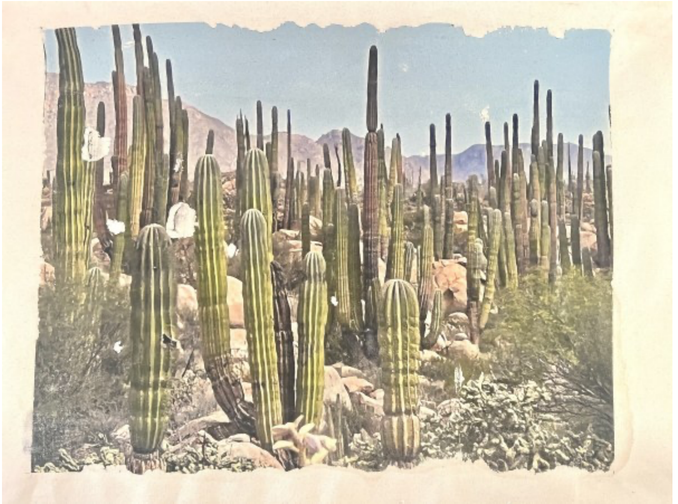
Baja, 2023 iPhone Image transfer onto canvas 101.6 cm x 76.2 cm 40 x 30 Inches £ 3,500.00