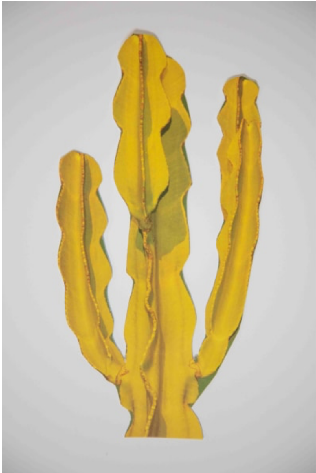
Desert Cactus, 2023 Chromaluxe Print on Cut Aluminium 70 x 40 Inches 177.8 x 101.6 cm Edition of 3 plus 1 AP £ 5,500.00