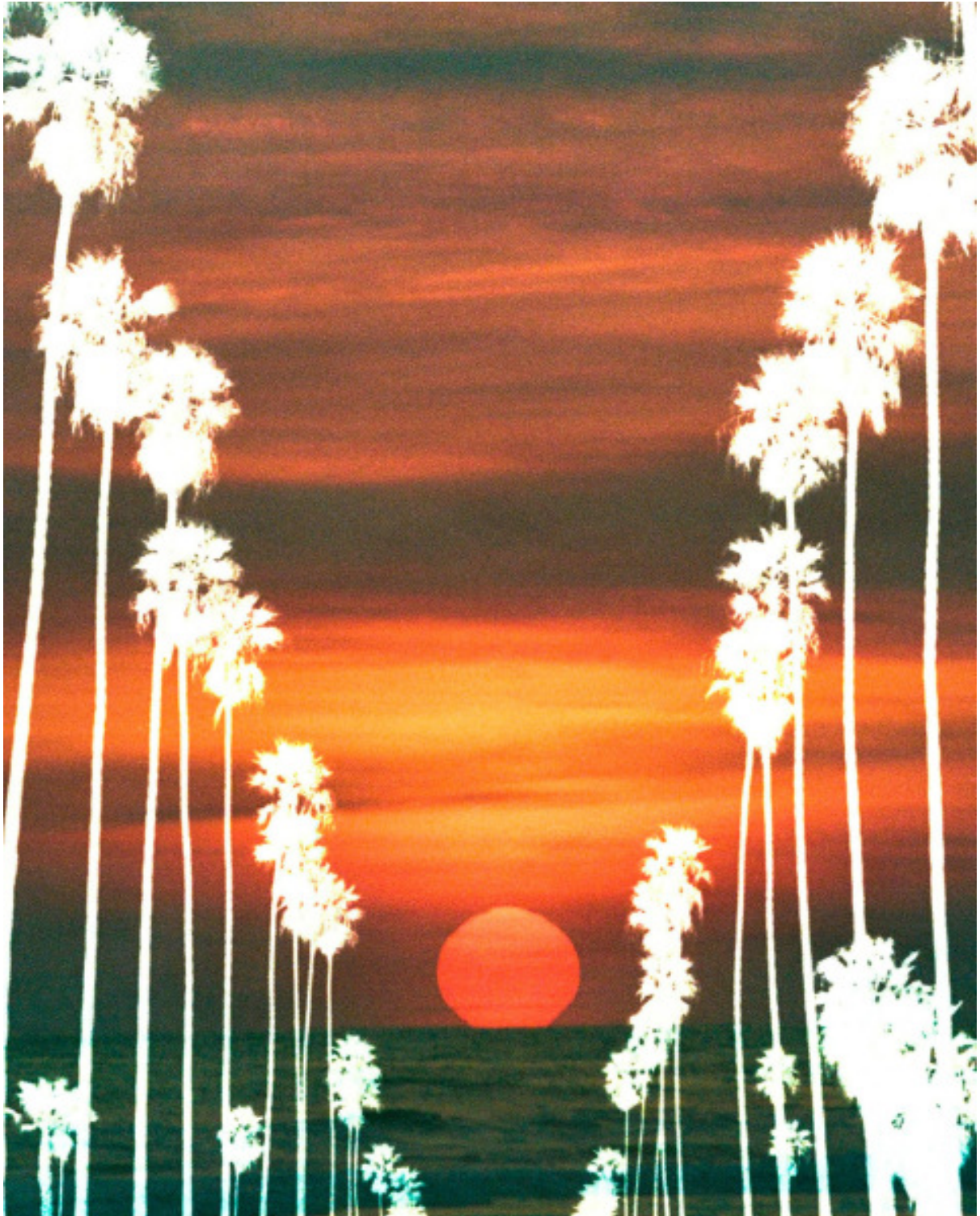
Ghost Palms, 2023 Double exposure | Los Angeles Giclée Print 36 x 45 Inches 91.44 x 114.3 cm Edition of 3 plus 1 AP £ 2,800.00