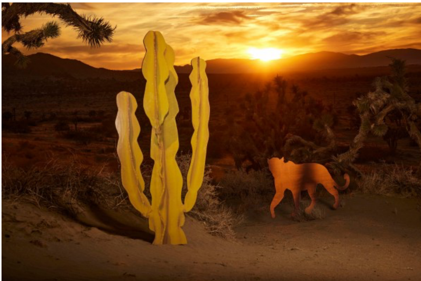
Sunset Prowl, 2022 YSL Photo Installation | Mojave Desert Giclée Print 45 x 30 Inches 114.3 x 76.2 cm Edition of 3 plus 1 AP £ 2,800.00