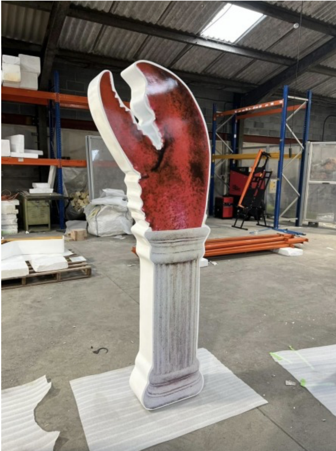
The Lobster, 2023 Foam, Polyurethane, Steel 26.4 x 78.1 Inches 67.1 x 198.5 cm £ 9,500.00