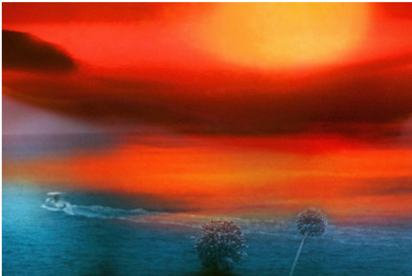
Jomo, 2020 Soaked Film Giclée Print 114.3 x 76.2 cm 45 x 30 Inches Edition of 3 plus 1 AP £ 2,800.00