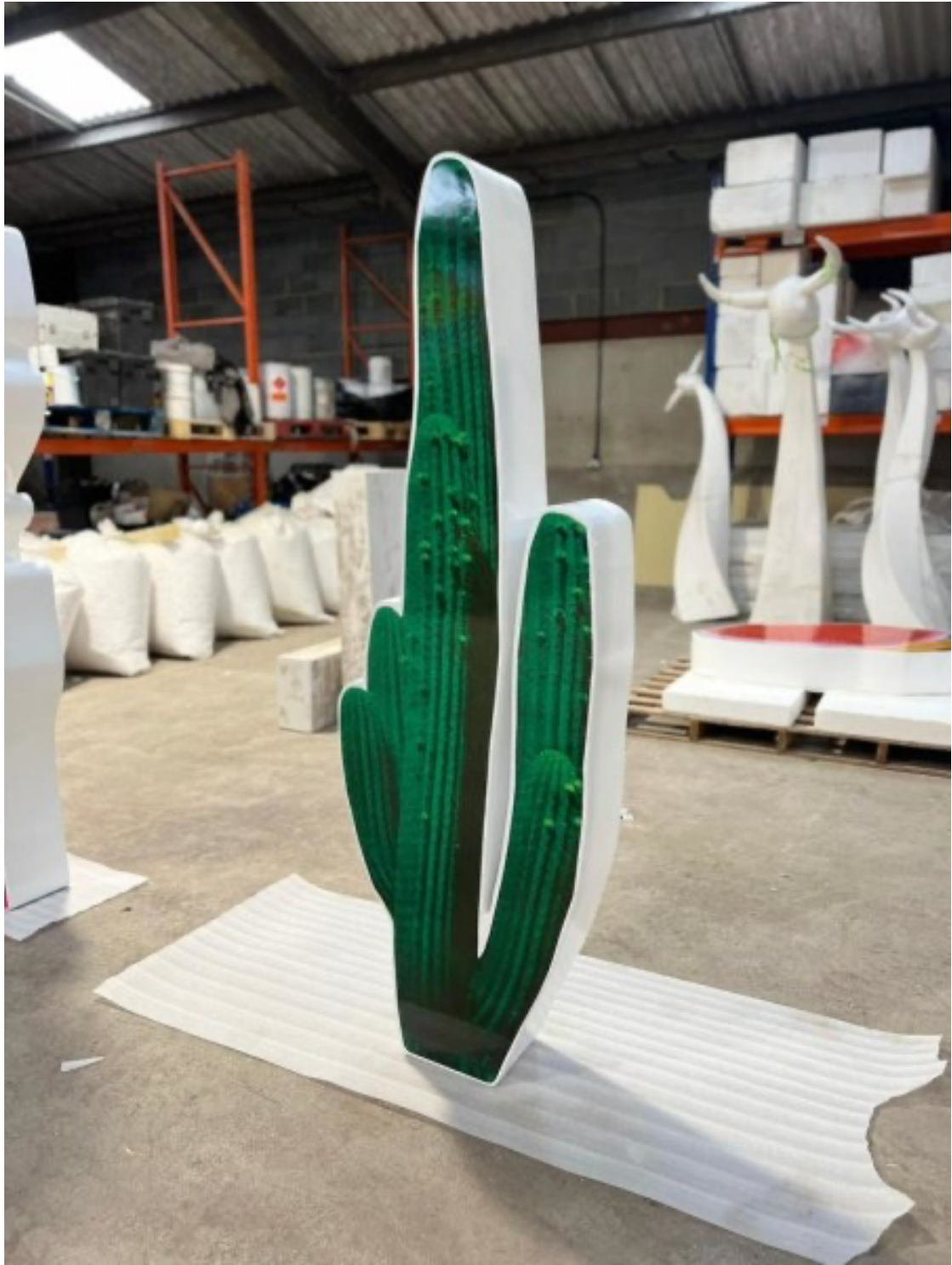
Green Cactus , 2023 Foam, Polyurethane, Steel 24 x 75 Inches 61.2 x 189.8 cm £ 9,500.00