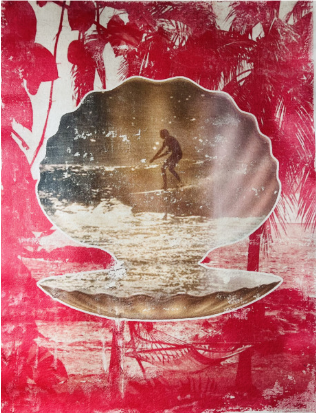
Endless Summer 1, 2023 Collage / Image transfer onto Canvas 76.2 x 101.6 cm 30 x 40 Inches £ 3,500.00