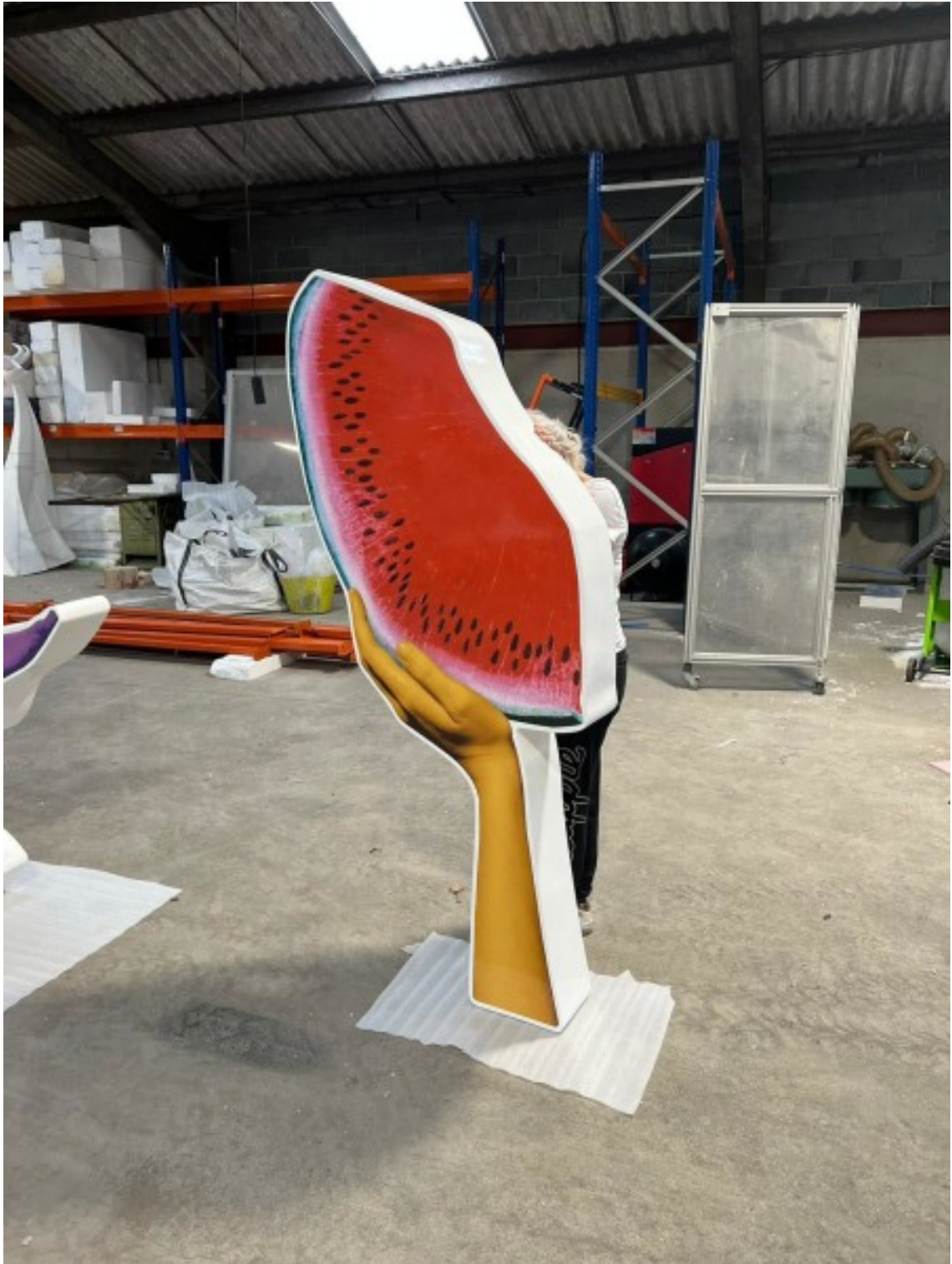
The Watermelon, 2023 Foam, Polyurethane, Steel 26.4 x 78.1 Inches 67.1 x 198.5 cm £ 9,500.00