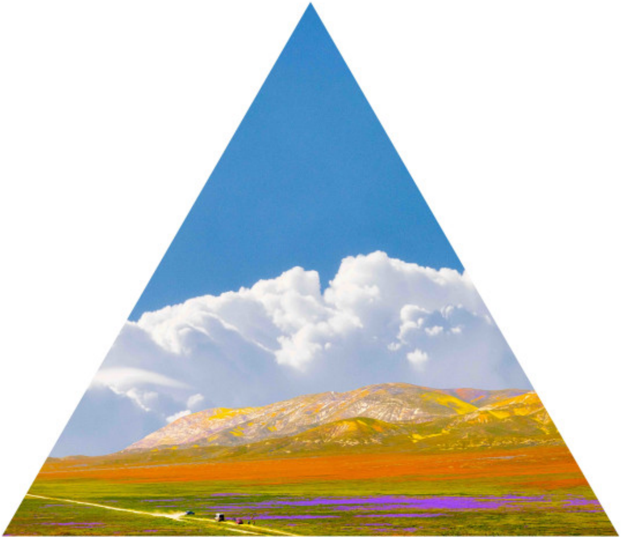
Superbloom, 2023 Anza-Borrego Desert State Park Lightbox 101.6 x 87.9 cm 40 x 35 Inches Edition of 3 plus 1 AP £ 8,500.00