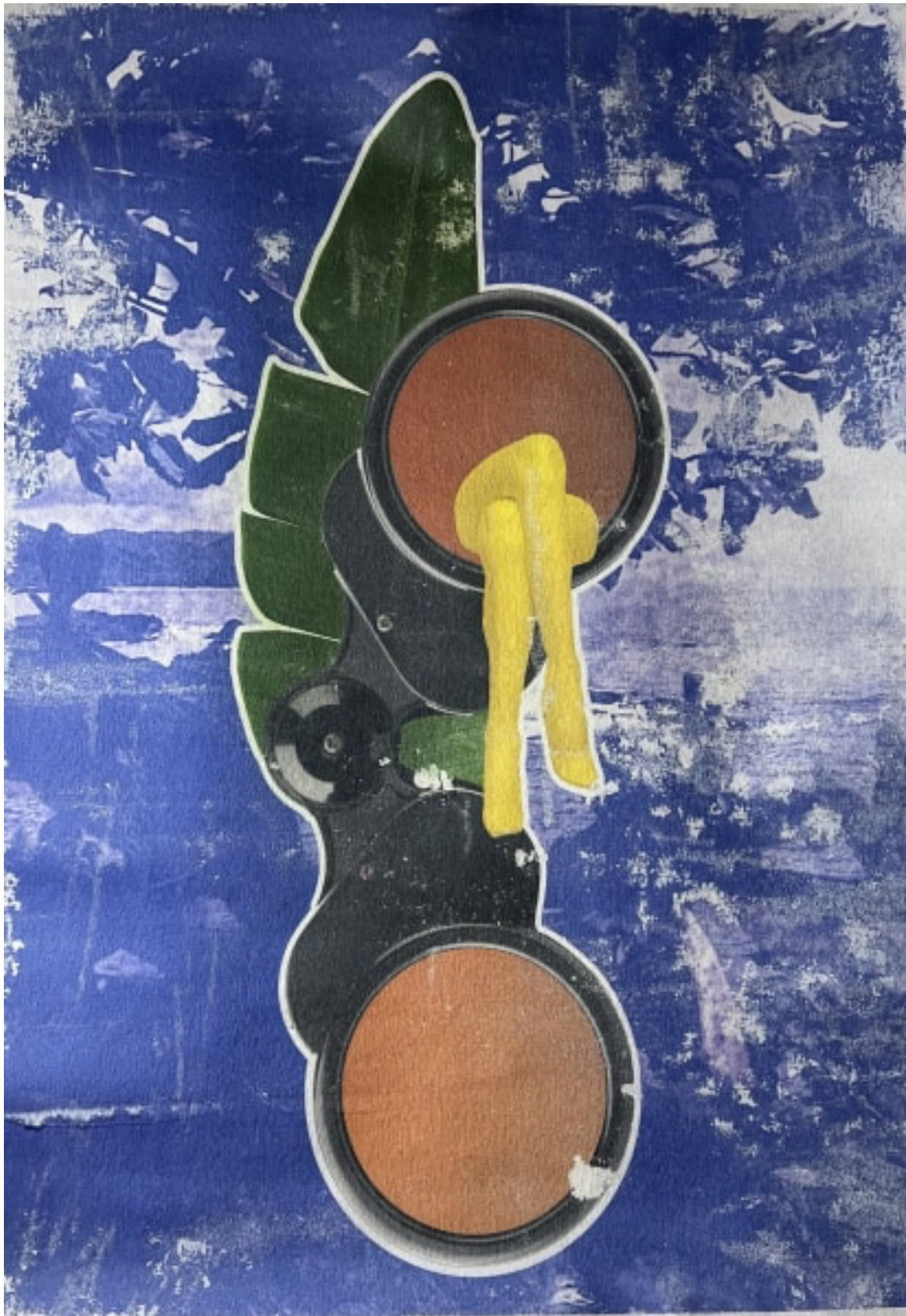
Endless Summer 2, 2023 Collage / Image transfer onto canvas 76.2 x 101.6 cm 30 x 40 Inches £ 3,500.00